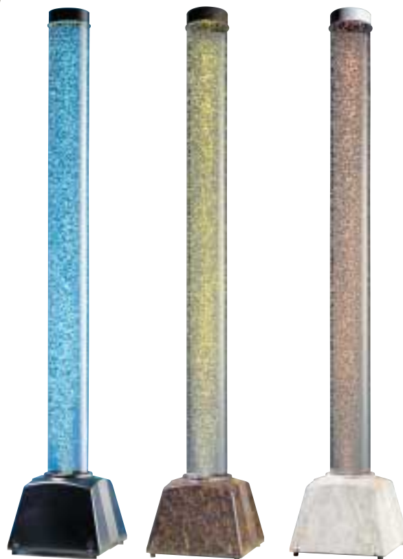
Colored black (standard)